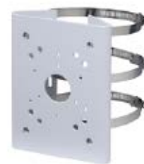
A36 POLE MOUNT