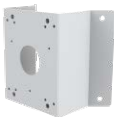
A35 CORNER MOUNT