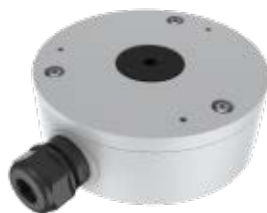
TC-P54BM SPEC: V5 JUNCTION BOX